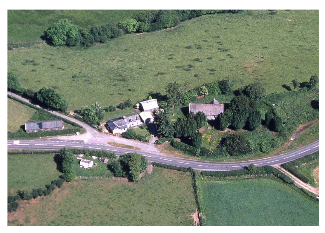
Llanfihangel Bryn Pabuan village, photo 95-C-0620 © CPAT 2011

We have not referenced the sources that have been examined to produce this report, but that information will be available in the Historic Environment Record (HER) maintained by the Clwyd-Powys Archaeological Trust. Numbers in brackets are primary record numbers used in the HER to provide information that is specific to individual sites and features. These can be accessed on-line through the Archwilio website (www.archwilio.org.uk).