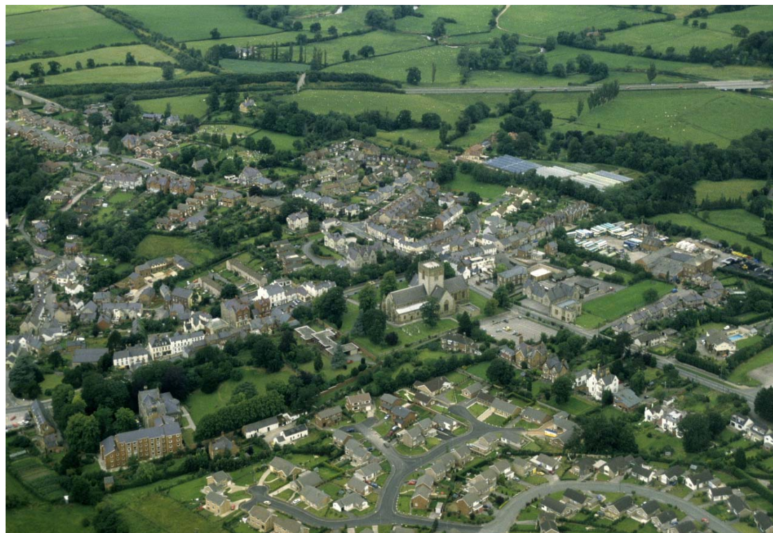
St Asaph, photo 87-C-0189

St Asaph Cathedral (102126) is cruciform in plan with a central tower and an aisled and clerestoried nave. With a length of little more than 55m, it is the smallest of the cathedrals in England and Wales. Building is known to have been in progress by 1239, but much of the cathedral was rebuilt probably between 1284-1381, having been burnt during the Edwardian Conquest in 1282. After its completion with the building of the tower in 1391-2, the cathedral was burned again, by Owain Glyndŵr in 1402. This necessitated re-roofing and other restoration work. There has been further restoration and repair work over the years, with a major one by Sir Gilbert Scott in 1867-75, and another in 1929-32. There are a number of 19th-century buildings associated with the cathedral. These include the Diocesan registry, a canonry (now Kentigern Hall) and Dean Williams Library.