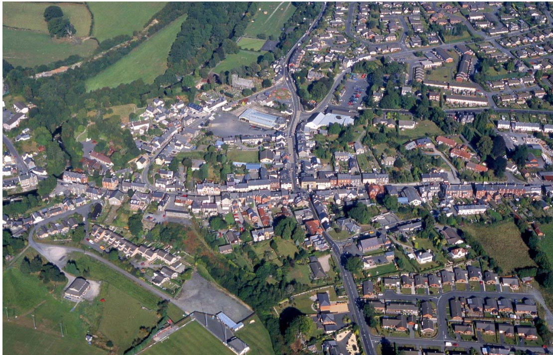
Rhayader town, photo 03-C-0566, © CPAT, 2011

We have not referenced the sources that have been examined to produce this report, but that information will be available in the Historic Environment Record (HER) maintained by the Clwyd-Powys Archaeological Trust. Numbers in brackets are primary record numbers used in the HER to provide information that is specific to individual sites and features. These can be accessed on-line through the Archwilio website ( www.archwilio.org.uk ).