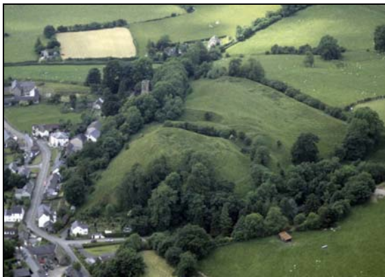
Aerial view of New Radnor Castle

From Broad Street walk uphill to the junction with High Street and turn left, then taking a lane on the right, rising behind the War Memorial, which leads to the St Mary's Church 1 , which was built in 1845. Continue along the south side of the church and through a gate leading to New Radnor Castle 2 .