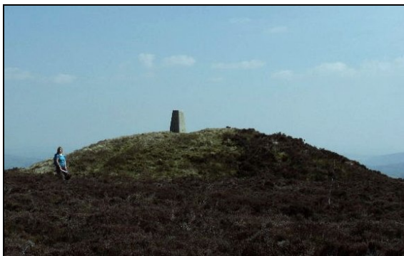
The Bronze Age barrow on the summit of Bache Hill

Return to the track, noting a third burial mound on the skyline to the north-east which will be visited later. Unfortunately, the intervening fields have no public access. Turn left and follow the track to the north-west. On reaching a junction of boundaries at a saddle (SO 20546381) cross the first stile on the right, next to a gate, and turn right alongside a pond to follow the edge of the forestry. Go through the gate at the far end of the field and turn right, leaving the bridleway, to follow the fenceline southwards.