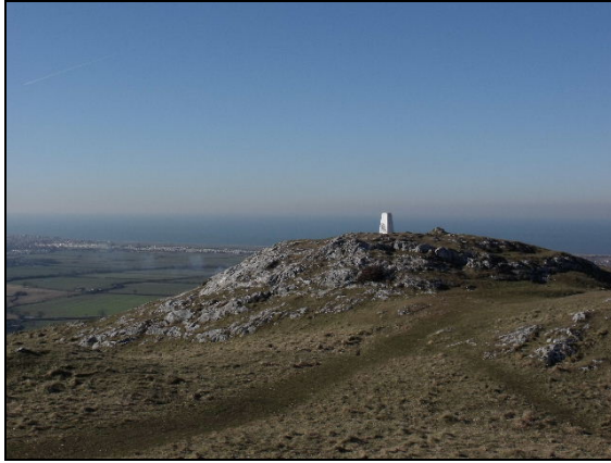
The summit of Graig Fawr (12)

Continue along the path, following signs for Bryniau, around the top of a quarry and eventually meeting a lane. Turn left, uphill and then right onto a road, retracing the outward route back to the carpark. There is the option of an ascent of Graig Fawr (12) , a prominent local landmark and an important area for nature conservation. From the summit there are excellent views on a clear day.