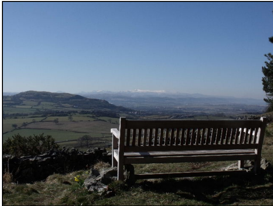
The view from Gop Cairn looking towards Moel Hiraddug and distant Snowdonia

This area is rich in evidence for past human activity. Neolithic (4,300 – 2,300 BC) skeletons were found in Gop Cave, above which is the largest man-made cairn in Wales, which is assumed to belong to the same period. There are also numerous Bronze Age (2,300 – 1,200 BC) burial mounds on the plateau, several of which are visited during the walk.