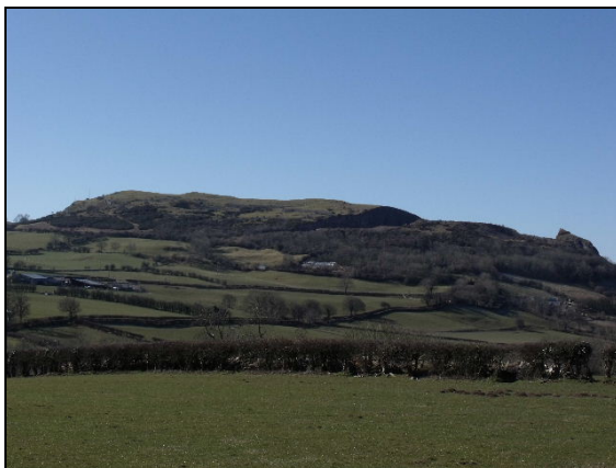
Moel Hiraddug Iron Age hillfort

Turn right and then cross the road, continuing over a stile, again following the Offa's Dyke path. This leads to another lane, where you turn right, descending into the valley. To the left are views of the Iron Age hillfort on Moel Hiraddug, the northern end of which has now been lost to quarrying.