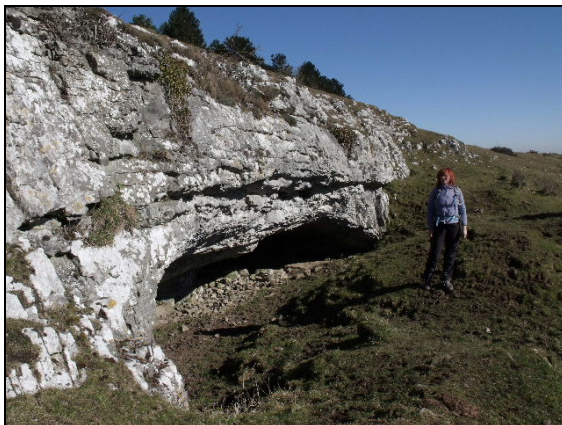
Gop Cave (4)

Follow the Llanasa road uphill and take the unnamed lane on the left after Bron Haul, at the end of which is a stone stile into a field. Follow the path to a signpost by a bench and turn right, uphill, between the patches of gorse. Head diagonally upslope to a prominent rock outcrop, at the base of which is Gop Cave (4) . The entranceway forms a natural shelter, leading to a cave beyond, both of which appear to have been used at various times from the Palaeolithic to the Neolithic. The site was excavated in 1886 and 1908 by Boyd Dawkins, and again in 1953 and 1962. A number of Neolithic skeletons have been found associated with pottery and a stone axe.