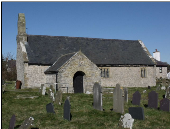
The Church of St Mary Magdalene (8)

A short detour on the left, along Ffordd Llyn Goch, leads to the Church of St Mary Magdalene (8) , which is recorded in Domesday Book, although the present building is later, possibly Norman in origin. Go through the churchyard and turn right into the village centre. For the Eagle and Child inn turn left by the phonebox, although the walk continues ahead, turning left along Ffordd y Ffynnon, which becomes a grassy lane leading to a well (9) , which was the main source of water for the village until after the First World War when standpipes were introduced.