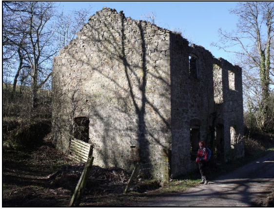
The ruins of Grove Mill (1)

At the hairpin bend follow the lane around to the right and over a bridge to the ruins of Grove Mill (1) . The flour mill was built in 1815 and closed in 1912, reopening again in 1920 only to close five years later. The waterwheel was on the west side of the building and the arched culvert which supplied the water can still be seen. The embankment behind the mill was constructed for a branch of the London and North Western Railway's Prestatyn and Cwm line, although it appears to have remained uncompleted.