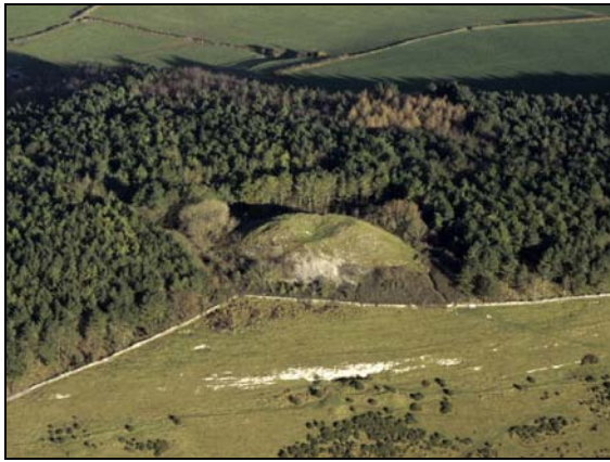
Gop Cairn (5)

Continue upslope to a gate which leads to Gop Cairn (5) , the largest Neolithic cairn in Wales, from the summit of which there are spectacular views west to Snowdonia, south-west to Moel Hiraddug hillfort, and south-south-east to the Clwydian Range. The man-made cairn, which is around 14 metres high and 100 metres by 70 metres across, was investigated by Boyd Dawkins in the late 19 th century, excavating a shaft through the centre of the cairn, giving the site its cratered appearance, along with two tunnels also driven in at the base. Although he found no evidence for a burial chamber it is generally assumed that the cairn may be similar to the Neolithic passage graves of Ireland, or possibly the much larger mound at Silbury Hill in Wiltshire.