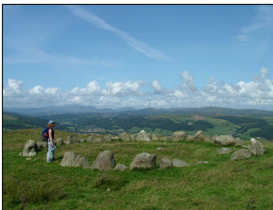
Moel Ty Uchaf Stone Circle

The stone circle is around 12 metres across and is composed of 41 surviving stones which have been set on edge so that most are touching, with a general alternation of a larger stone followed by one or two smaller stones. There are two obvious gaps in the circle, which may be the result of robbing. Inside the circle there is a slight mound up to 5 metres across and 0.3 metres high which has been disturbed, probably by antiquarian investigations. Moel Ty Uchaf is an unusual site which may have had a burial and ritual function. Although it has the appearance of a stone circle, there are also similarities to the kerbs surrounding some of the upland burial cairns, and the central mound may once have covered a burial.