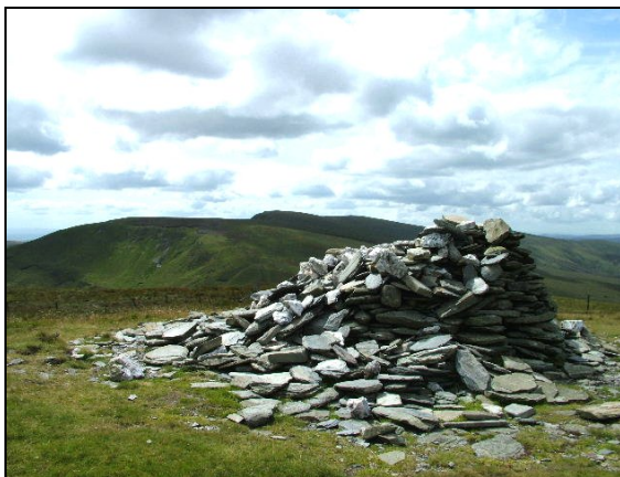
The summit of Cadair Bronwen with the Berwyn ridge behind

Returning to the pass follow the obvious path along the ridge to cross a stile on the first summit, bearing right along the edge of the ridge. The trig point (827 metres; SJ 0722432719) stands on the low remains of a Bronze Age burial cairn (7) . Continue to the highest point (830 metres), passing a second, more obvious burial cairn (8) at SJ 0718032450 which has been remodelled to form a shelter.