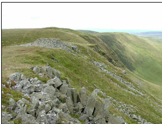
One of the burial cairns along the Berwyn ridge

Return to the trig point and cross the stile to descend W along an obvious path, which is boggy in places. Cross a second stile and continue ahead. Towards the base of the ridge a prominent pile of stones on the left mark the remains of a large burial cairn (9) which has been remodelled to form a shelter (SJ 0482033323).