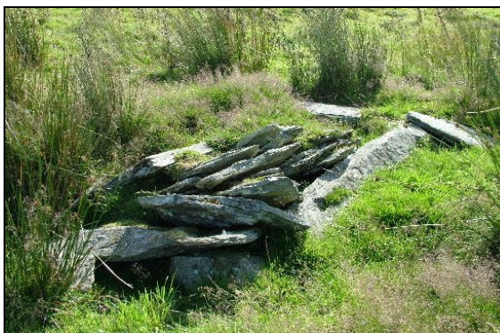
Cist below Moel Ty Uchaf

The track crosses two shallow fords and passes through four gates before reaching a crossroads with a group of conifers beyond. Turning right the walk now follows a track which linked the valleys of the Dee and Tanat, via Bwlch Maen Gwynedd . Continue through the gate and around 60 metres before reaching a gate through the fence on the right, near the end of the forestry, leave the track and turn left, directly upslope for 40m to a well-preserved stone cist (1) in a small patch of reeds at SJ 05445 37140. This is the best preserved of four such sites which are essentially small, stone-built burial chambers which may be prehistoric or medieval in date.