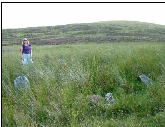
Cerrig Bwlch y Fedw stone circle

From the circle head S, downslope to a raised circular Bronze Age platform cairn (3) around 16 metres in diameter at SJ 0564537112. This low earthwork is now almost entirely covered by turf but may originally have consisted of a ring bank of stone, possibly retained by a kerb, the centre of which was later infilled with more stone to form a level, circular platform. The function of these sites is uncertain and they may have had both a ritual and burial purpose and excavated examples elsewhere have uncovered cremations sealed beneath the platform.