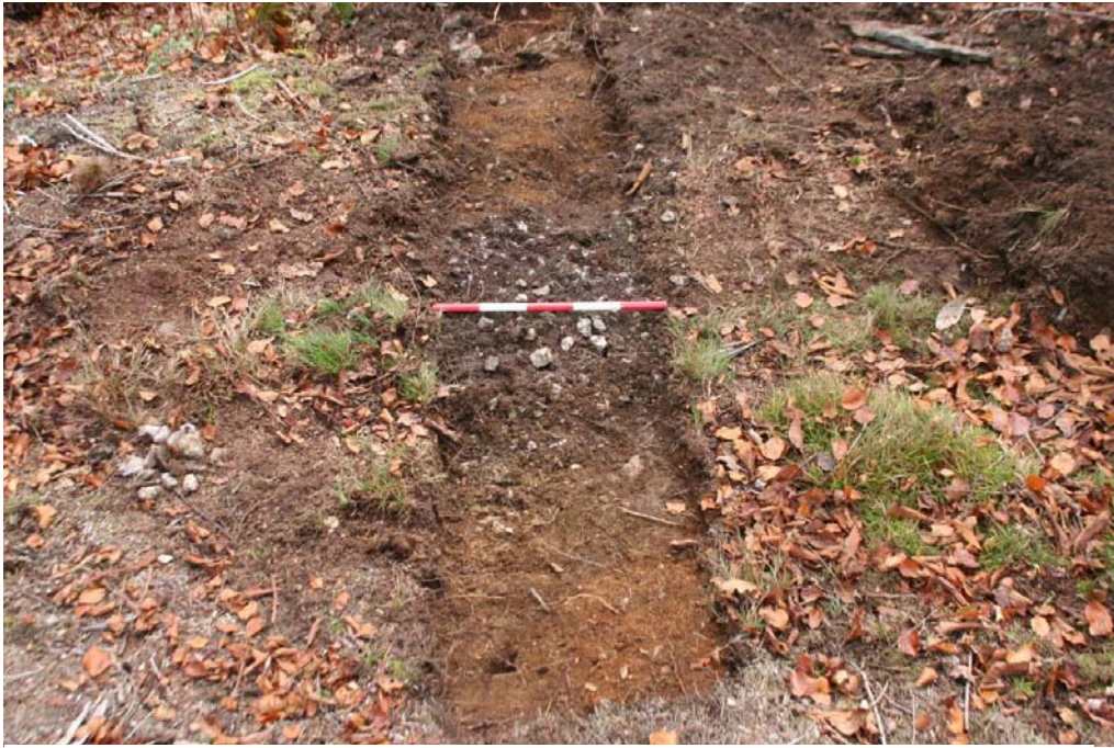
Plate 1: South-east facing shot of Trench 1. 1 x 0.5m scale