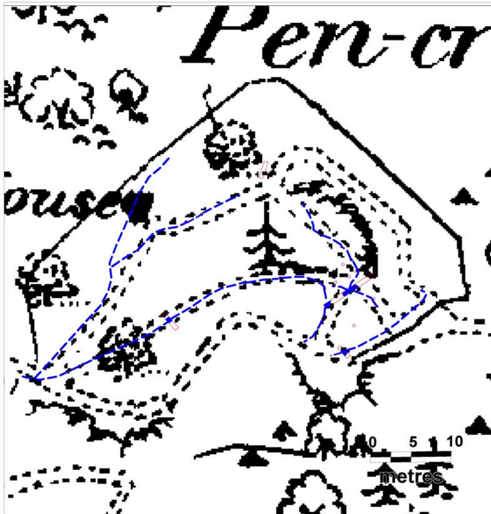
Figure 3: Copy of the OS 1:2500 1888, showing paths surveyed at that date. Overlaid on it are the position of trenches and pits, with blue dotted lines showing the path alignments confirmed by excavation.