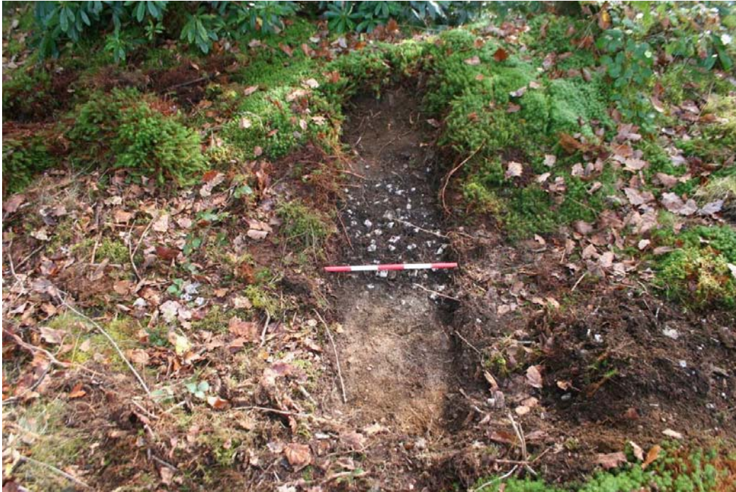
Plate 5: South-east facing shot of Trench 4. 1 x 0.5m scale.