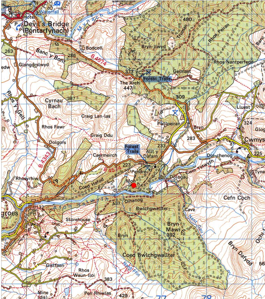
Figure 1: Location map, based on the Ordnance Survey.

Reproduced from the 1995 Ordnance Survey 1:50,000 scale Landranger Map with the permission of The Controller of Her Majesty's Stationery Office, © Crown Copyright Cambria Archaeology, The Shire Hall, Carmarthen Street, Llandeilo, Carmarthenshire SA19 6AF. Licence No AL51842A