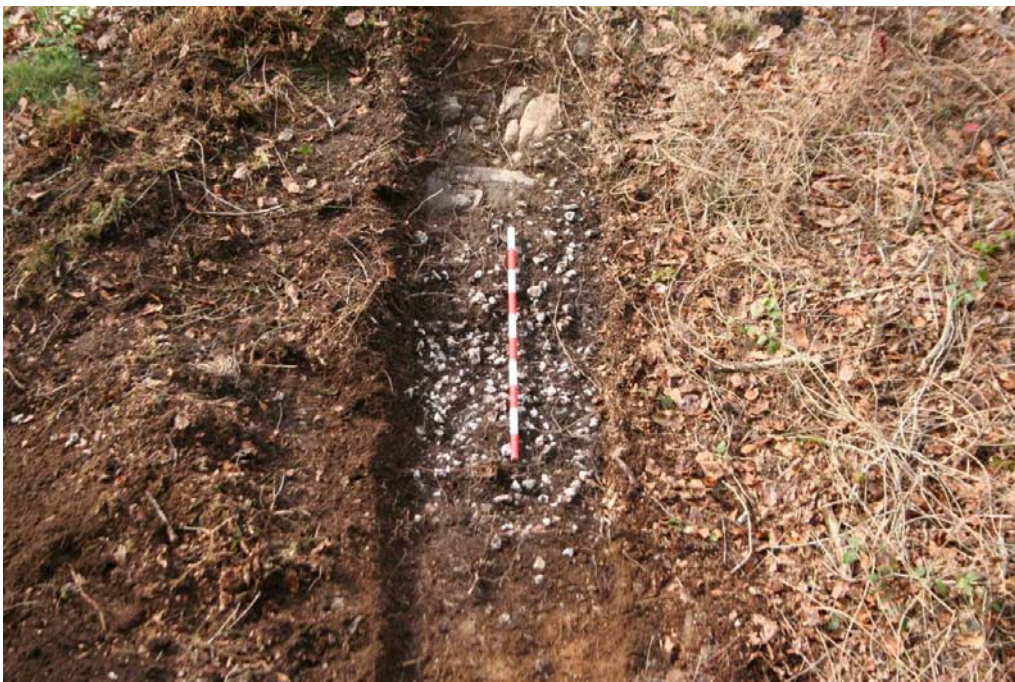
Plate 4 (below): Close-up of central pathway.