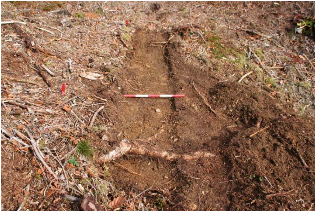
Plate 2: North-east facing shot of Trench 2. 1 x 0.5m scale.