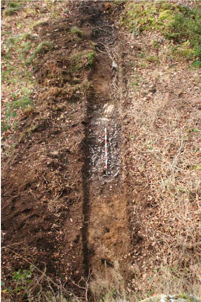
Plate 3 (left): South-west facing shot of Trench 3. 1 x 1m scale.